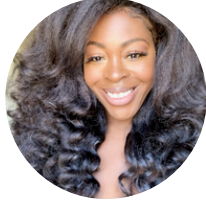
Jennifer Diaz Puahi's Polynesian Dance Company