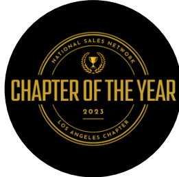
Demese Black Sanofi Aventis